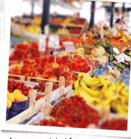
A proven catalyst for economic development