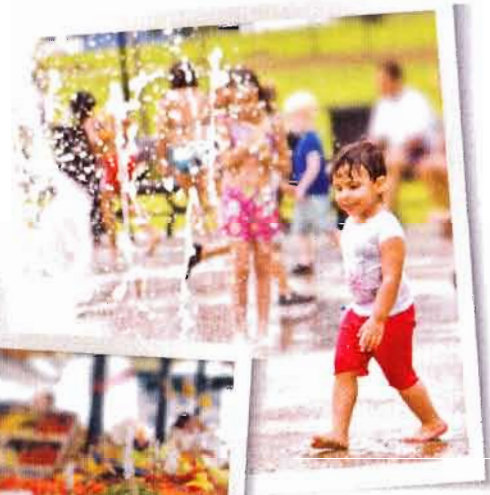
A place for families to enjoy